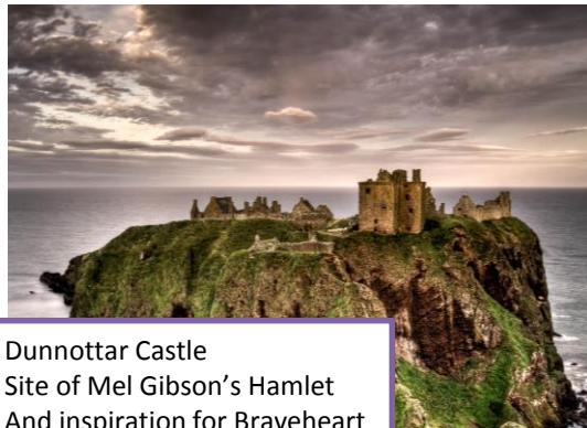
Dunnottar Castle Site of Mel Gibson's Hamlet And inspiration for Braveheart